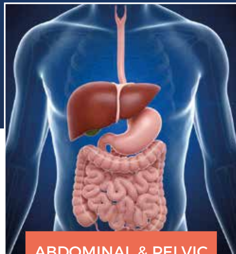
ABDOMINAL & PELVIC

FLUTTER integrated into the 2000 ml drainage bag